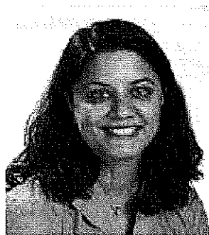
NOT a good photo (too close)