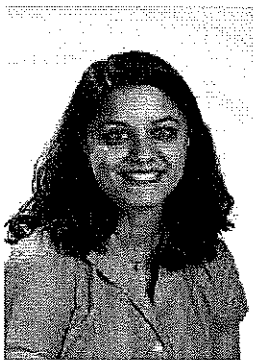
Good Photo! More of the body is okay too...we will crop it.